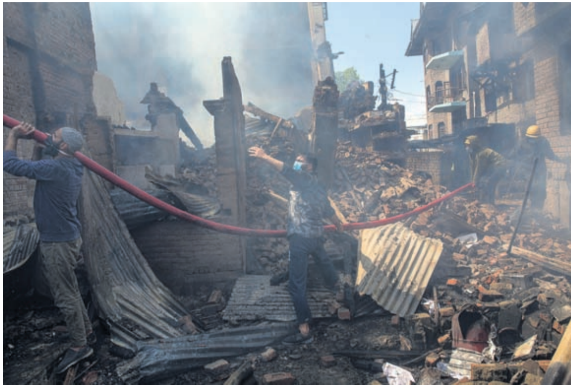
Kashmiri men and fire fighters douse a fire in a house which was destroyed in a gun battle in Srinagar, Indian controlled Kashmir, Tuesday, May 19, 2020.